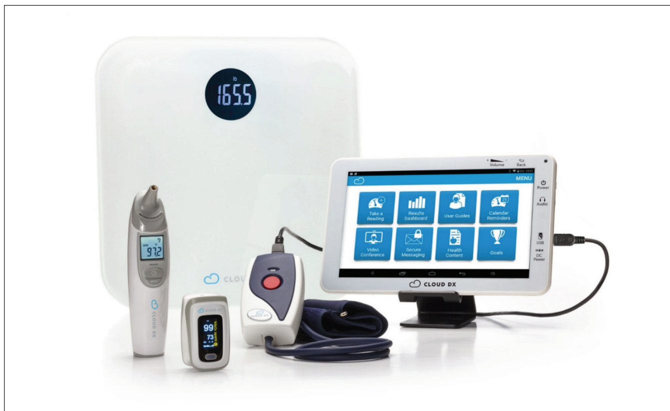
Figure 2: Cloud DX Connected Health Kit, including Bluetooth-enabled Pulsewave wrist cuff blood pressure monitor, body weight scale, wireless oximeter and temperature probe, paired with Android health tablet.

Research staff teach patients assigned to receive virtual care with RAM how to use the cellular modem-enabled tablet computer and RAM technology from Cloud DX (Figure 2). Daily for 30 days, patients take biophysical measurements and complete a recovery survey, and nurses review these results (Appendix 1C).