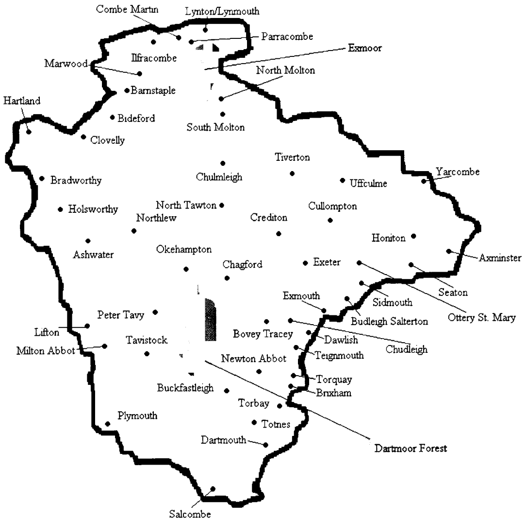
Map 2: County of Devon