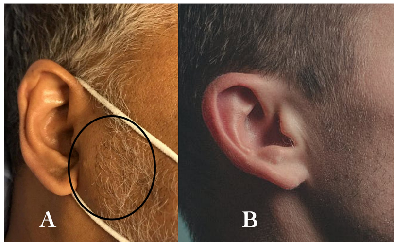
FIGURE 2: (A) The reported case with circled sideburn obesity (B)

Anatomical illustration of the underlying structures of the sideburn area of the face