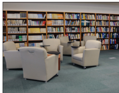
The CLL Library space, outside of the Teaching Commons Classroom.

Since its opening the Inquiry Classroom has been used to host curriculum and program reviews, departmental retreats, cohorts of Education 750 – CLL’s graduate course on teaching and learning, Avenue to Learn instructional sessions, workshops on specific teaching topics and other teaching related professional development activities. Indeed, there are few limitations on how the Inquiry Classroom might be used.