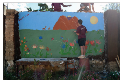
Mac Serve Global - Peru 2011: Team Peru was invited to paint a mural on the wall they had just rebuilt for a local school.

With this in mind, I am very excited about the development of our new Community of Practice focused on the theme of Community Engagement. Through the CoP we are hoping to engage faculty, staff, students and community members around the immense potential that lies in university-community partnerships. I am sure the discussions will be rich and compelling and that we will have an opportunity to focus on developing students that are globally minded, socially engaged and civically active.