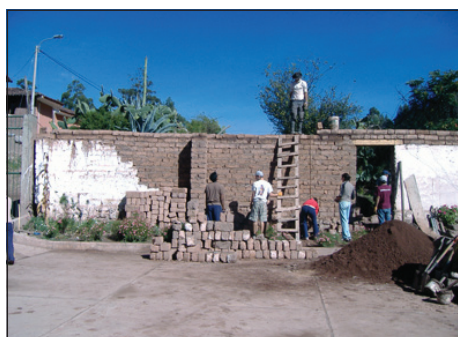
Mac Serve Global - Peru 2011: In addition to creating a school garden, Team Peru re-constructed a damaged wall.

Another aspect of my role is to build our campus capacity to responsibly connect our teaching and learning interests with the immense resources that Hamilton has to offer. I believe that McMaster students have a lot to offer and a lot to gain from engaging meaningfully in the world around them. The good news is that