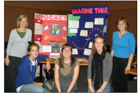
Social Work students displaying their work for Social Change: Advocacy & Social Action at a poster presentation session.

There have been some challenges in incorporating this form of experiential education. Students are uncertain at first and feel uncomfortable with the lack of structure to the course. It is difficult to keep track of the students as they engage in so many projects, but having the mentors is a big plus. The mentors ensure that students have effective, topical, community-based support and direction. Their presence means that students are engaged in projects that are useful to the community as well as effective for their education. It is also difficult to balance the hands-on education with traditional academic content. I have reduced lectures to every other week and the reading load is lighter. I believe that when students understand the theory they learn more deeply and they retain it in combination with the skills they develop.