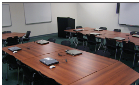
The CLL Teaching Commons Classroom.

The Inquiry Classroom is a space intentionally designed to foster collaborative, inquiry learning and discovery. Moveable desks allow for multiple classroom configurations to facilitate discussion and conversation, while a SmartBoard and white boards offer platforms for presentations and interactive work. Comfortably seating up to 31 participants, the Inquiry Classroom also supports 15 users with laptops and wireless access.