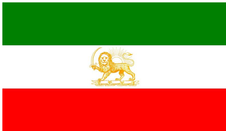
FIGURE 1: LION-AND-SUN FLAG 2019

In the diaspora, the three predominant representative Iranian flags include the lion-and-sun flag, the Islamic Republic flag, and the white flag. The lion-and-sun flag is the flag of the monarchist era, which was prominent in the diaspora after the Islamic revolution of 1979. The Islamic Republic flag is the current official flag of Iran, which constitutes a contested political and religious symbol for the members of the diaspora. And lastly the white flag, which for some, is identified as the flag of ‘the people’, is inclusive of all diversities. Many community members argue that the white flag ought to be the Iranian diaspora’s flag. These three flags symbolically represent the ongoing tensions and contestation within the Iranian diaspora. While each flag represents different sets of political ideologies, each one entails an internalized social and cultural interpretation tailored for the Iranian diaspora.