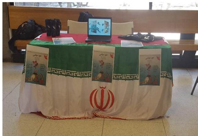
FIGURE 9: STUDENT ASSOCIATION SELECTED IRANIAN FLAG