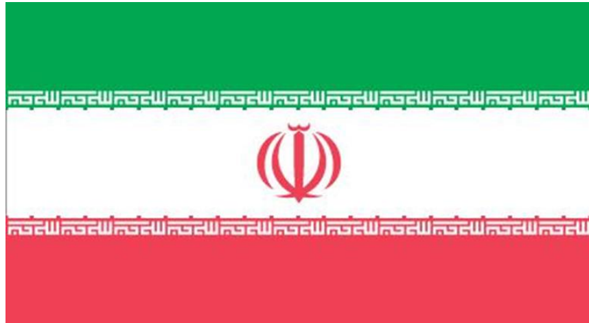
FIGURE 2: ISLAMIC REPUBLIC FLAG 2019