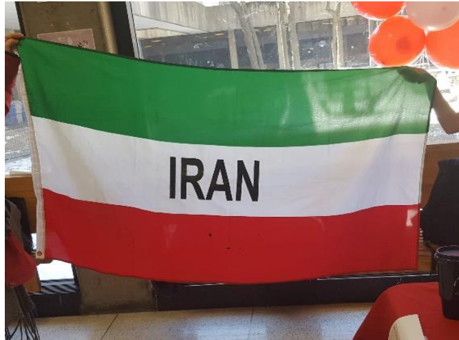
FIGURE 8: STUDENT ASSOCIATION IRANIAN FLAG

interesting to see the results of the vote almost ten years after the first flag disagreement. The Iranian Student Association's members voted to have the Islamic Republic of Iran flag as their representative.