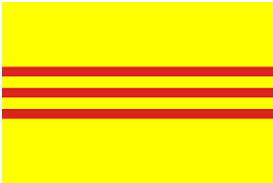
FIGURE 4: PRE-COMMUNIST MOVEMENT VIETNAMESE FLAG

The flag debates within the Vietnamese and Tamil diasporas are symbolic representations of both resistance and community development. The Vietnamese communist regime, similar to the Islamic republic regime of Iran, redesigned the original South Vietnamese flag to represent the new government's principles and values. Anna Vu (2015) describes the flag debate among the Vietnamese community by differentiating the communist flag (red flag with a yellow star) from the original Vietnamese flag (The yellow flag with three red stripes). The original flag commemorates the lives of those who were lost and dislocated as the result of the communist takeover (ibid).