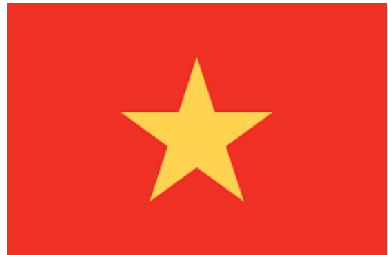
FIGURE 5: OFFICIAL VIETNAMESE FLAG

In the diaspora, the original Vietnamese flag is a symbol of communal identity, which is inseparable from the diasporic norms and values. Vu (ibid) argues that the original Vietnamese flag represents the symbolic boundary that influences the diasporic membership. On the other hand, the Tamil's tiger flag is not a national, but a communal flag of freedom. The Tamil's tiger flag is a "red banner featuring a growling Tiger's head flanked by AK-47 assault rifles"(O'Neill 2015).