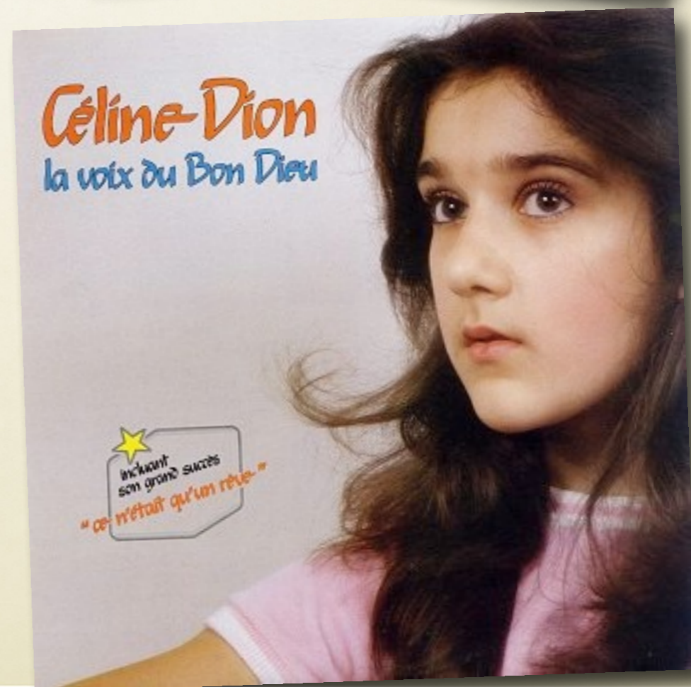
Céline Dion, b. 1968