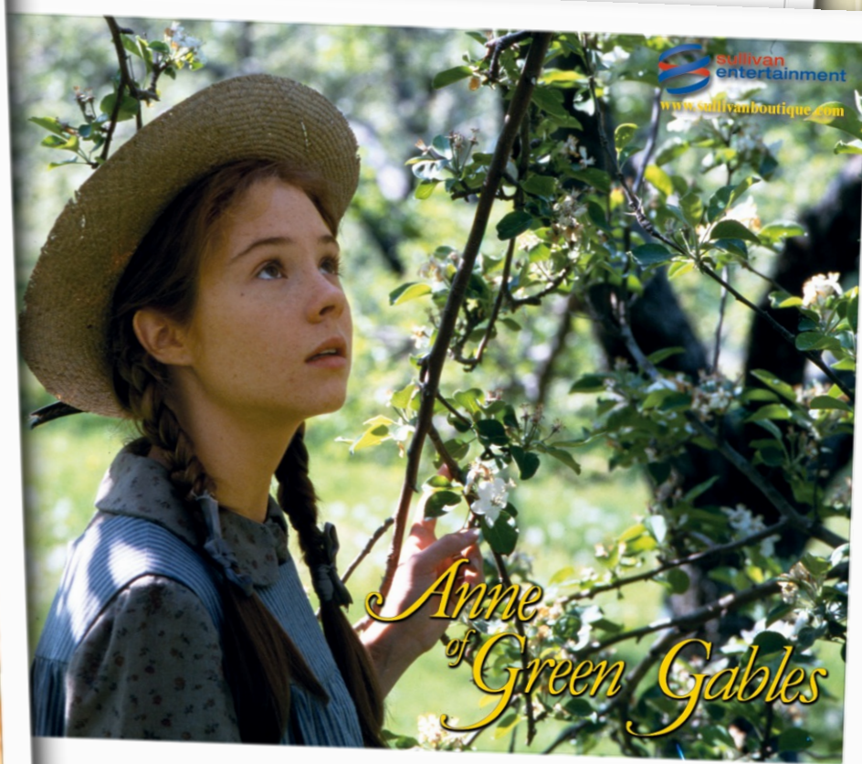
Anne of Green Gables

Sullivan entertainment www.sullysboutique.com