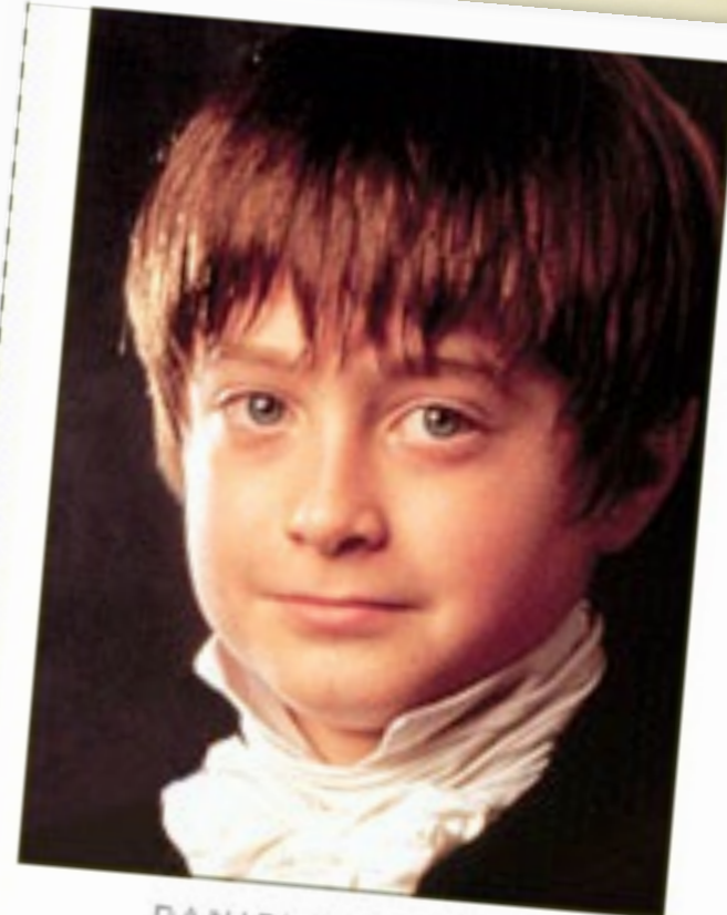
DANIEL RADCLIFFE AS DAVID COPPERFIELD

THE DELICIOUS MUSICAL BASED ON THE CLASSIC CHARLES DICKENS NOVEL