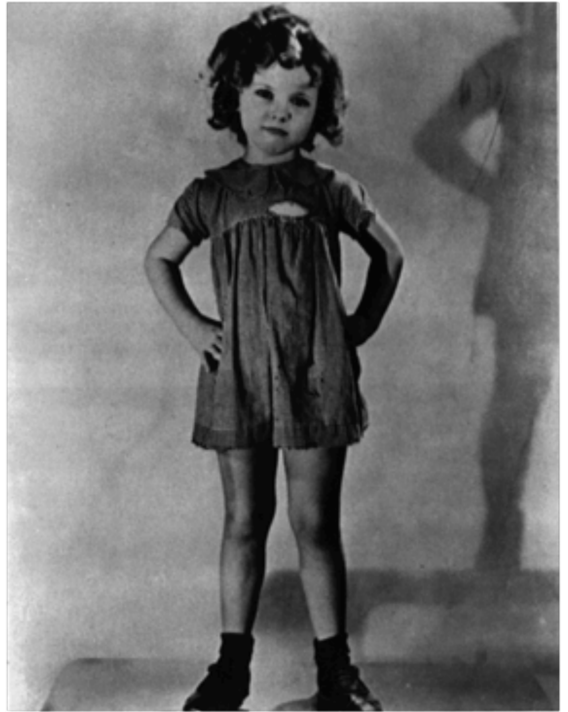
Shirley Temple, Little Miss Marker, 1934