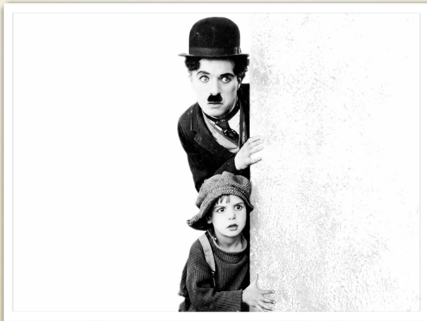
Jackie Coogan, b. Los Angeles, 1914