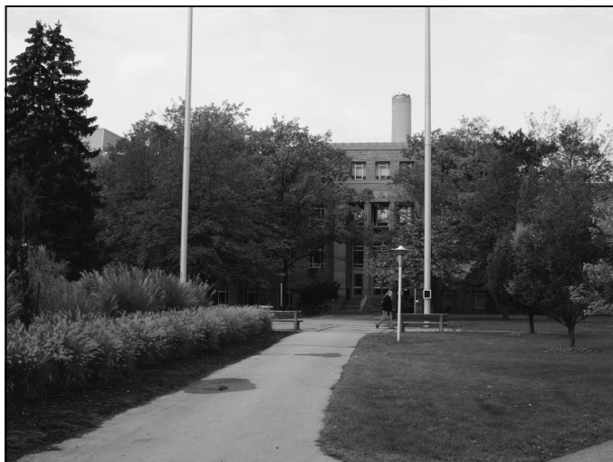
Burke Science Building

For more information please visit the Centre for Leadership in Learning in T-13, Room 124 Enquiries 905 525-9140 Ext. 24540. Email: horvath@mcmaster.ca Website: http://www.mcmaster.ca/cll