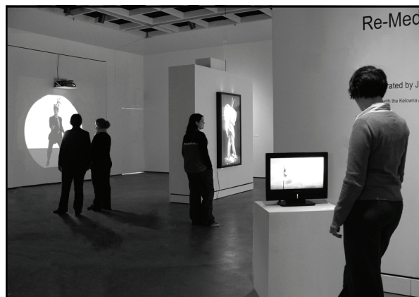
Re-Mediations Exhibition, Winter 2007 McMaster Museum of Art